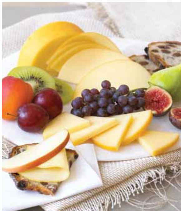
left: Seasonal Fruit and SLICING CHEESE platter. below: Baked Macaroni and GOUDA CHEESE with spinach. recipes: www.boarshead.com

These are among the world's culinary treasures, meats and cheese that are the centerpiece of some of Europe's most revered recipes.